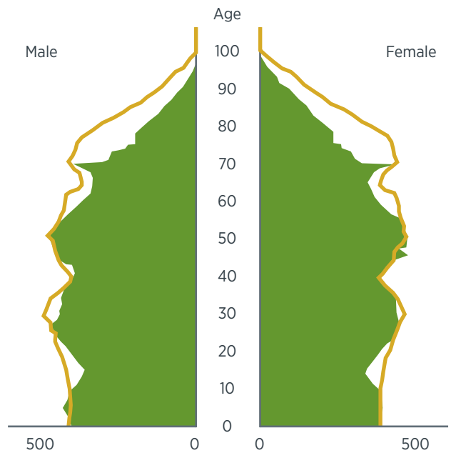
Figure 1: Age structure of the UK population, mid-2016 and mid-2041 (ONS)

population (thousands) in each age band outline shows year 2041