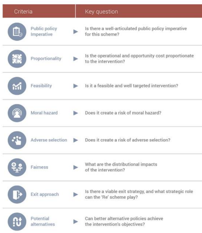
Figure 4: 'Re' scheme decision making framework

Interventions such as Flood Re could have potential to boost take up in certain areas, although care needs to be taken around how and with which product lines these are implemented. Previous work by WPI Economics looked to design a framework to be able to determine where these interventions are appropriate.