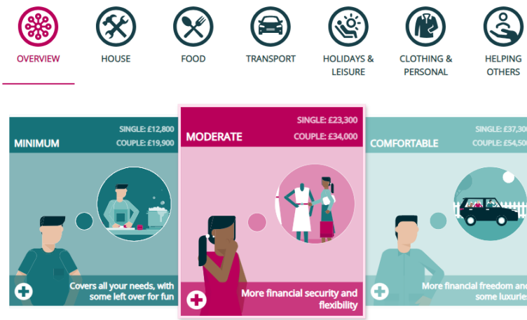
Figure 1: PLSA Retirement Living Standards

Source: PLSA Retirement Living Standards iv